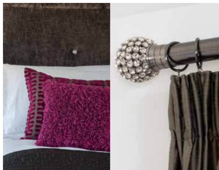
[Above and below] The master bedroom opens on to a balcony and has an oversized velvet headboard from A&M Robinson to complement its generous dimensions. [Opposite] Tiling in the bathrooms is by Porcelanosa, with shower enclosures by Matki and sanitaryware by Keuko and Villeroy & Boch, all from Boscolo Bathrooms